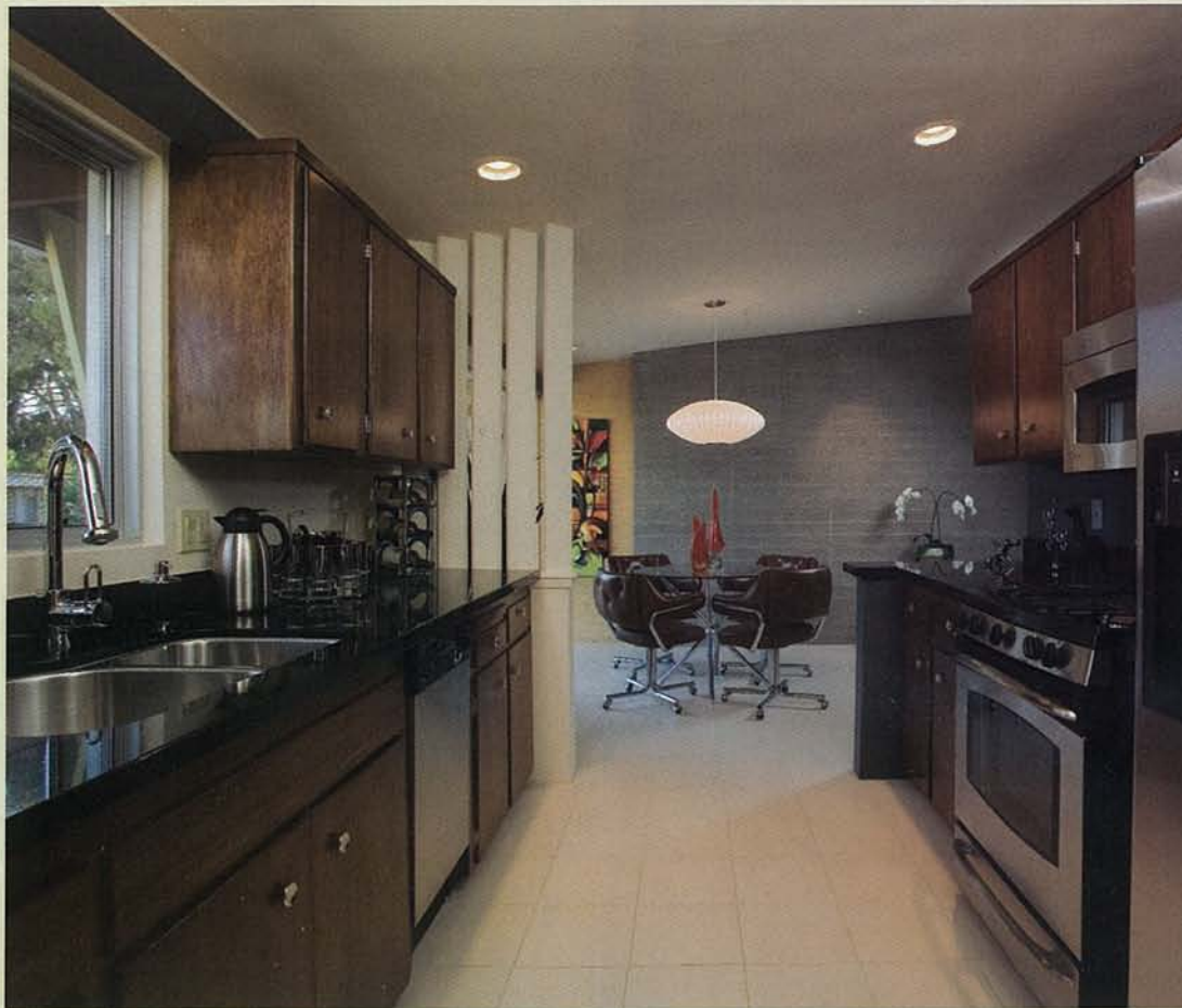
Original Philippine ribbon mahogany cabinetry was revamped and jazzed-up with Black Galaxy granite countertops and stainless steel appliances. The concrete block wall was constructed and sandblasted to create a visual continuation of the outdoors coming inward.

IN A QUIET CUL-DE-SAC SURROUNDED BY SMALL URBAN FARMS IN NORTH PHOENIX, THIS unassuming ranch home was slowly stripped of five decades of wear then chiseled and reshaped into a contemporary earth angel by one of the most discriminating tastemakers of our time, environmental designer Troy Bankord.